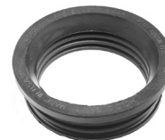
Part No. XH 950 Quik-Tite Gasket Extra Heavy

**Extra Heavy Quik-Tite Gasket Furnished