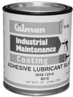
Part No. LUB 910 Adhesive Lubricant***