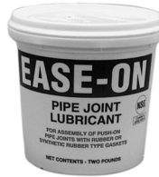
Part No. LUB 910 Regular Lubricant***