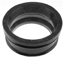
Part No. SV 900 Charlotte® Seal Gasket Service