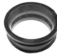
Part No. XH 900 Charlotte® Seal Gasket Extra Heavy

**Extra Heavy Quik-Tite Gasket Furnished