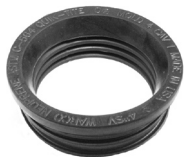
Part No. SV 950 Quik-Tite Gasket Service