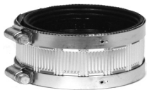
Part No. NH 1 No-Hub Coupling