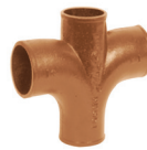
Part No. HP NH 30 Edge HP Sanitary Cross