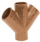
Part No. HP NH 21 Edge HP Double Wye