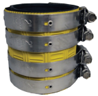
Part No. MDC 2 Heavy Duty (MD) Coupling