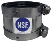
Part No. NH 1 No-Hub Coupling