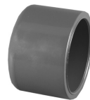
Part No. PVC 8116 Cap (SOCKET)