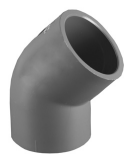
Part No. PVC 8309 45 Degree Elbow (S x S)