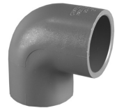
Part No. PVC 8300 90 Degree Elbow (S x S)