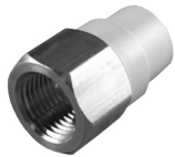
Part No. CTS 2105 L Low-Lead Female Adapter, Brass Threads (BRASS FPT x CTS SOCKET)

Note: Different discount may apply to brass items. Please contact sales office.