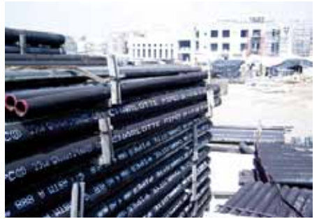
Cast-iron piping is a cost-effective solution when dealing with fire-resistive construction because it will not melt or burn away in a fire.

5% of the inner diameter of the pipe, according to the ASTM D 2321 standard – or only a quarter-inch for 4-inch pipe.