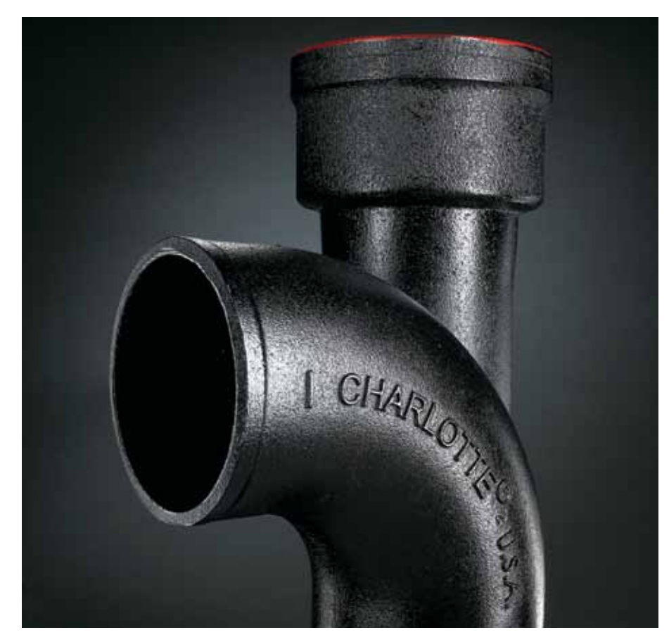
Charlotte Pipe and Foundry does not recommend the use of plastics as a replacement for cast iron specifically in underground, commercial high-rise construction, or high-end custom homes.

What meets code and what represents the best solution can be two very different questions.